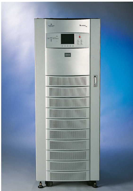
Figure 2. New UPS systems, such as the Liebert NX, are being designed with compact footprints to minimize their impact on data center space. A 30 kVA Liebert NX has a footprint of just 24 inches by 32.5 inches

A rack-based approach provides protection on a rack-by-rack basis, as individual UPSs are purchased and installed with each addition of network equipment. This approach is often adopted in smaller facilities that are not expected to grow and in cases where future capacities are impossible to project. While a rack-based approach may seem cost-effective, it is important to evaluate the implications of this approach in terms of both space and dollars.