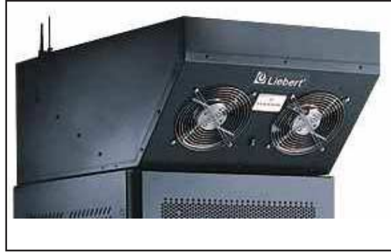
Figure 2. Complementary cooling systems, such as the Liebert XDV, bring targeted cooling close to the source of heat to supplement the capacity of traditional cooling systems.

These systems can be easily added to the existing infrastructure to reduce on a per rack basis.