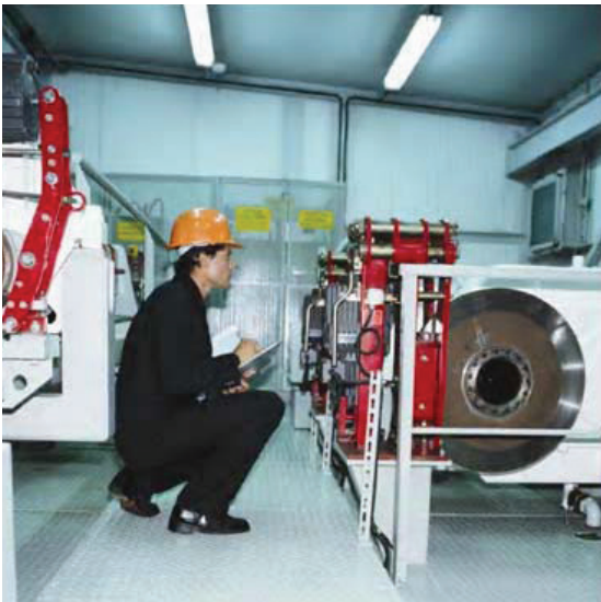
Figure 3. An electrical assessment can evaluate the integrity of a facility's power system to maximize availability of mission-critical infrastructure.

The electrical assessment is a critical part of the overall data center assessment since businesses have a 30 percent probability of experiencing power quality problems if their facility is more than five years old and has undergone significant changes. Evaluating the electrical system onsite, as seen in Figure 3, will help determine whether it is adequate for the data center now and in the future. Analyzing the integrity of the facility's power system will also help maximize availability of the mission-critical infrastructure.